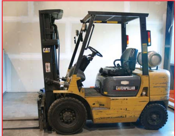
CATERPILLAR PROPANE FORKLIFT MODEL GP25K, 5,000 LB CAPACITY

This brochure is meant merely as a guide. Infinity Assets make no guarantee, expressed or implied, as to the accuracy of the information in this brochure. Buyers should inspect the goods beforehand to satisfy themselves.