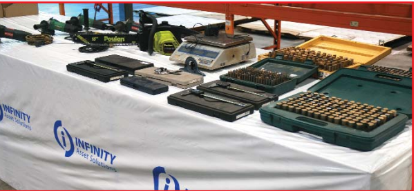
PARTIAL VIEW OF PRECISION INSPECTION EQUIPMENT. POWER TOOLS ETC.

Lot assorted Office Furniture & Equipment, FELLOWES Paper Shredder, HP Color Laserjet CM4730 MFP Colour Laser Printer Copier, NORTEL Norstar Phone System w 6 Handsets, Kitchen Bar Fridge, Microwave, Coffee Maker