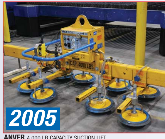
ANVER 4,000 LB CAPACITY SUCTION LIFT